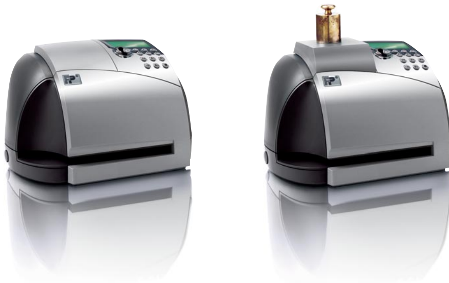
Franking machine with optional integrated scale for small mail volumes