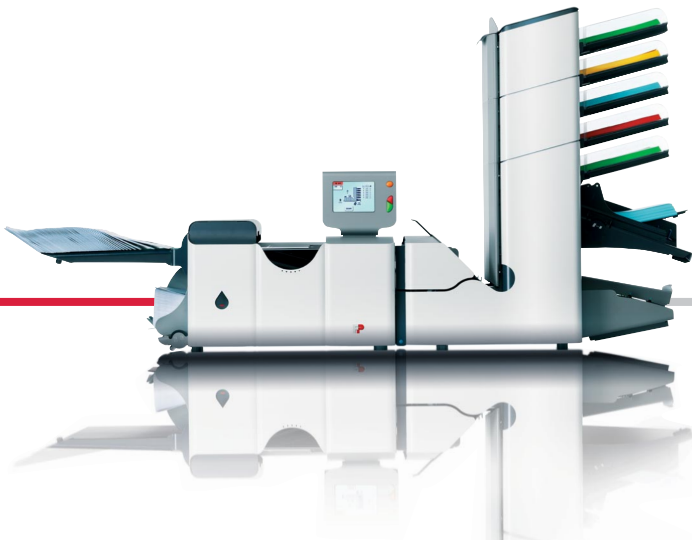
FPi 5500 Inserting system

A flexible, high-performance inserting system.